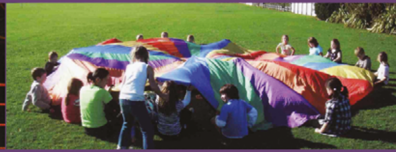
School Holiday Programme