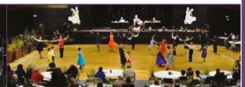
Southland Festival of Dance