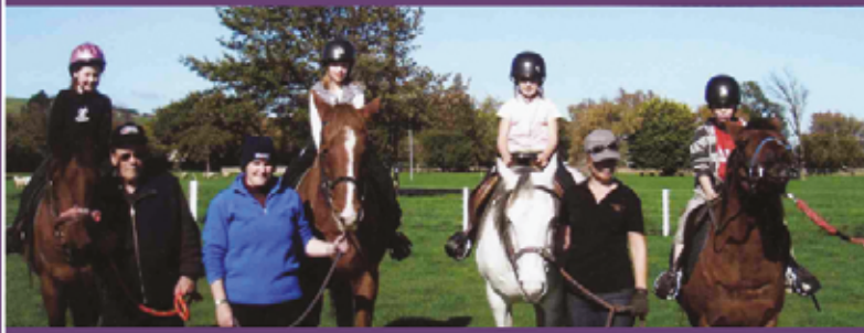
Riding for the Disabled