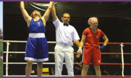
Gore Boxing Club